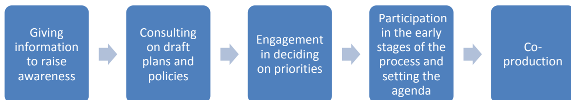
Figure 1 Levels of Involvement

Participation: People being actively involved with policy makers and service planners from an early stage of policy and service planning and review.